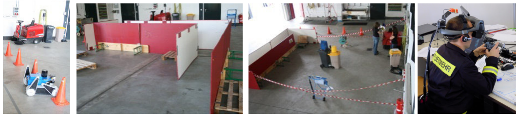
Figure 1: a) slalom task, b) narrow hallway and stop before collision task, c) detect objects task, d) operator controlling robot with game controller and head mounted display (Mioch et. al, 2012).

results of the experiment showed that the difference in collisions (SA measure) in the detect objects task explained 40% of the variance in the scenario. For performance a correlation was found between the number of collisions in the detect objects task and the scenario. Furthermore, individual differences turned out to influence performance and SA both in the unit tasks as well as in the scenario. In summary, the detect objects task is most capable of predicting SA in the scenario. However, individual characteristics may not be ignored.