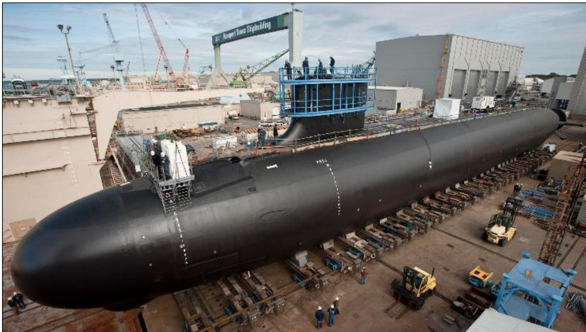
Figure 1. Virginia-Class Attack Submarine

Source: Cropped version of photograph accompanying Dan Ward, “Opinion: How Budget Pressure Prompted the Success of Virginia-Class Submarine Program,” USNI News , November 3, 2014. The caption credits the photograph to the U.S. Navy and states that it shows USS Minnesota (SSN-783) under construction in 2012.