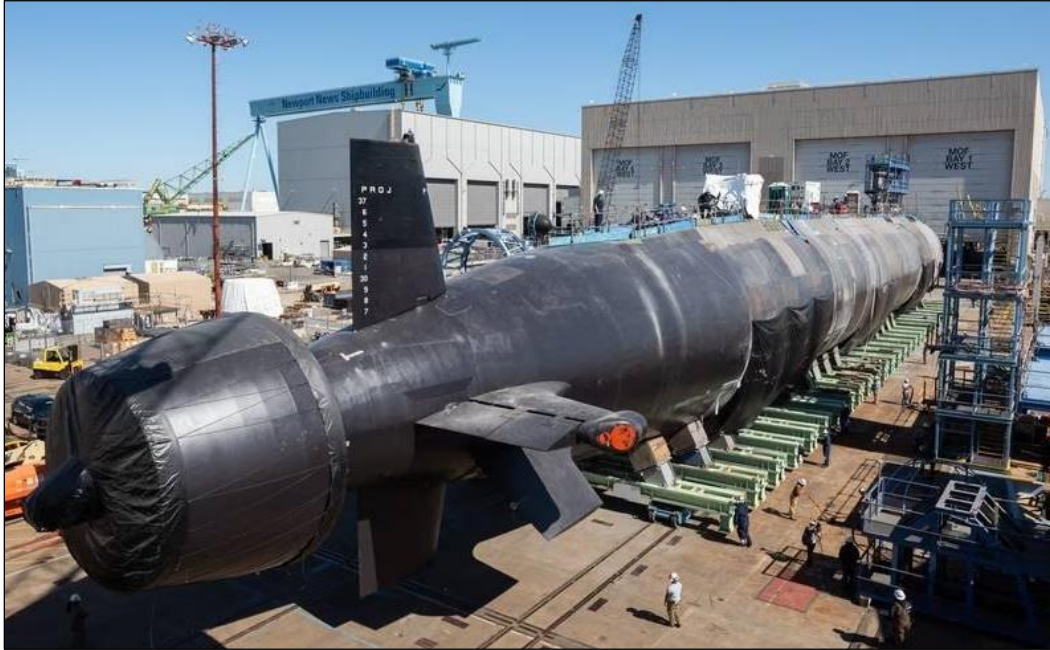
Figure 2. Virginia-Class Attack Submarine

Source: Cropped version of photograph accompanying Megan Eckstein, “Newport News Has Fully Staffed Attack Sub Line, After Years of Delays,” Defense News , February 9, 2023. The caption credits the photograph to Matt Hildreth/Hill and states that it shows USS Montana (SSN-794) under construction at Hill/NNS.