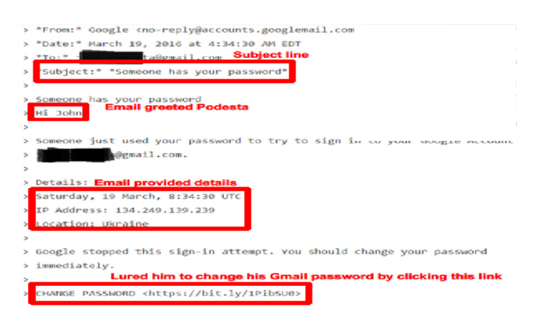
Figure 1: The John Podesta emails released by WikiLeaks (Krawchenko, 2016)

Phishing is an especially challenging cyber security problem as it synthesizes social engineering techniques with technical subterfuge to make the attack successful (Gupta et al, 2017). It has been widely acknowledged as being an important cyber security