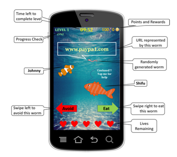
Figure 3: Various components of Phish Phinder represented through the user interface

1. Narrative – The participants were unanimous in their opinion that the game, while being educational and aiming to spread awareness of phishing, should have an evolving story which would keep the player engaged. One participant, for example, said " I only play games which take me somewhere .