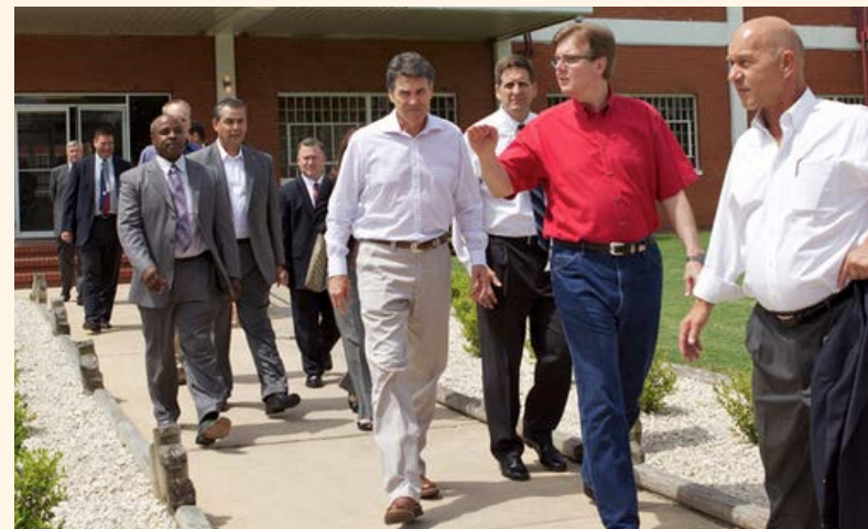
Gov. Rick Perry signed prison reforms into law in Texas in 2007. He is seen here visiting a prison in Rosharon, Texas.