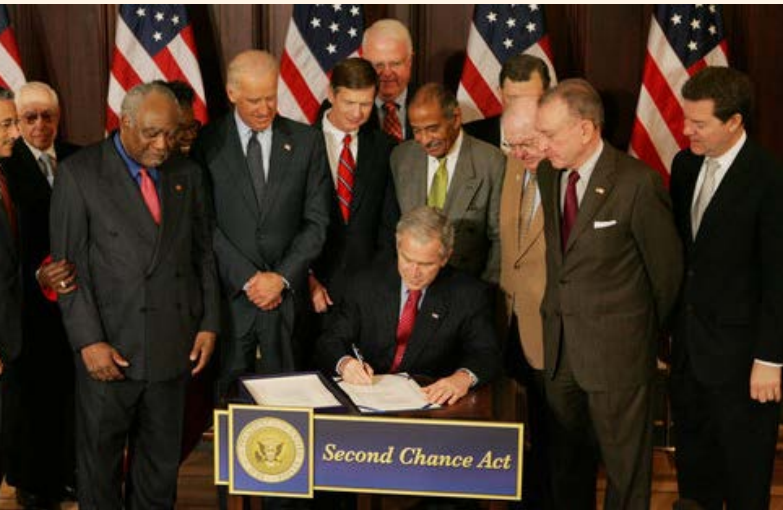
President Bush signed the Second Chance Act into law in 2008.