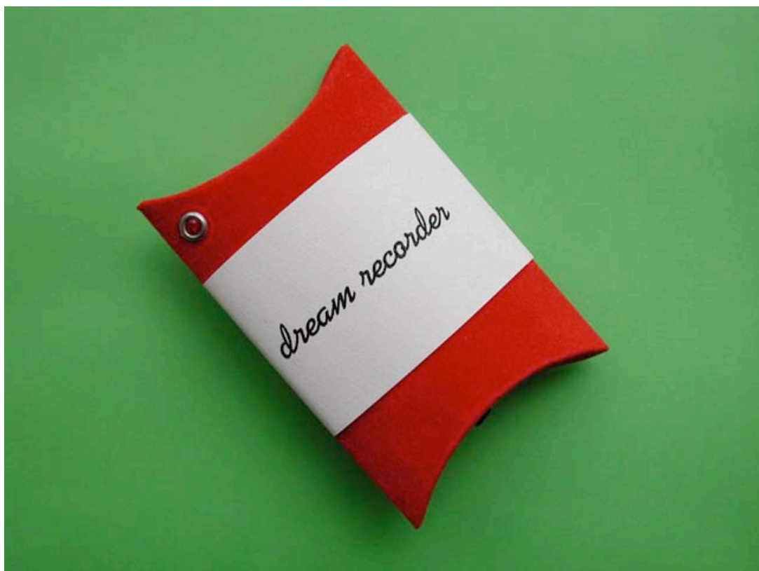
Figure 3. A Dream Recorder.

None of these tasks (or any of the others we used) produced returns that were easy to interpret, much less analyze. How could you compare two photographs, even if you knew both were meant to show "the spiritual centre of the home?" It would be difficult to know for certain what the photographer had meant to highlight, and impossible to know its exact significance. Similarly, it is tricky to analyze friends'