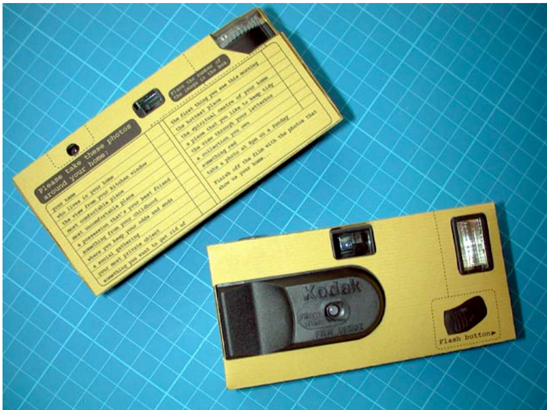
Figure 1. A disposable camera repackaged with requests for specific pictures.

For this study, we distributed domestic Probe packages to 20 volunteer households recruited through advertisements in popular London periodicals and signs posted on newsagents’ windows. We made no attempt to control demographics, but our volunteers came from a wide range of circumstances: from ages 18 to 80, rich and