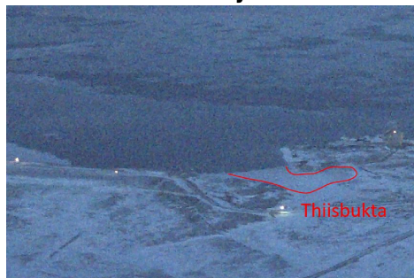
(b) Frozen fjord and bay