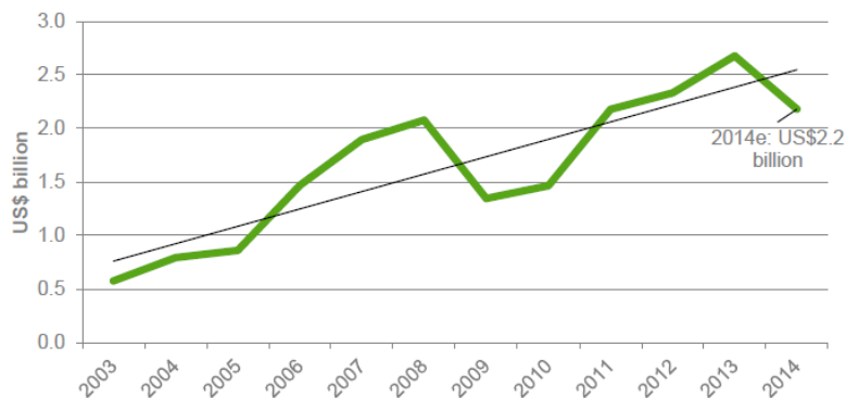
Costa Rica: Total FDI