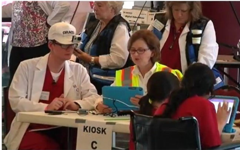
Figure 5. Student with GoPro™ at kiosk station.

HCI data. The SUS surveys were completed by nurses, helpers, and students (see Supplementary Material Appendix D ). 24 These surveys focused on EDICT's HCI elements and provided specific guidelines for future revisions to improve the user interface of EDICT. EDICT's mean SUS score was 72.93 (SD 16.49), which is considered above average. 25 In addition, the open-ended question provided details for improvements and revisions.