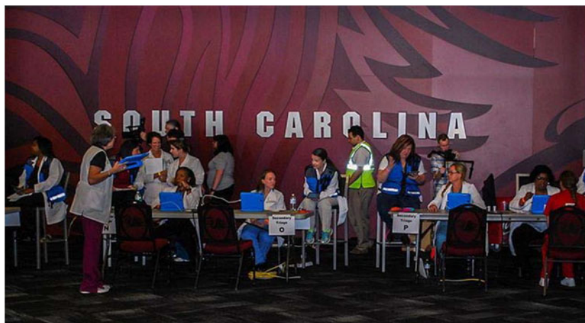
Figure 4. Secondary triage nurses' station with patients, observers, and IT staff.

FE and provided a robust review process. These videos can assist in resolving potential data problems (eg, missing patient ID, etc.). In addition, the GoPro added a unique perspective of the FE flow and process.