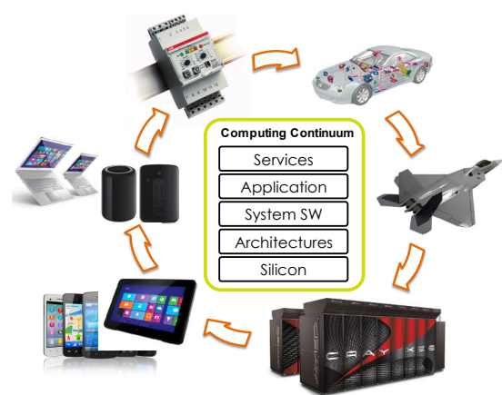
Figure 1: The computing continuum

susceptibility to transient faults (soft errors) and permanent faults (device degradation, wear-out) [2]. One of the biggest challenges for future technologies is the implementation of “dependable” systems on top of significantly unreliable components, which will degrade and even fail during normal lifetime of the chip.