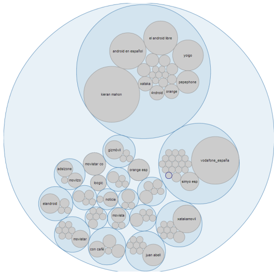
Figure 2. Visualization of communities and influencers.

The query execution can be monitored using the integrated system for real-time monitoring and analysis X-Ray (see Figure 3), where the user can view details for each operation running within the process, including relative start/end times of operation executions, intermediate cardinalities, rewritten queries, etc.