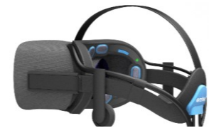
Figure 2: Faceteq integrated on Oculus CV1

will demonstrate how the Faceteq system works to interested attendees.