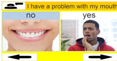
Fig 3. Primary Screen included in the prototype.

In the final task, the participants were required to select symptoms via a digital prototype developed using the requirements discussed in [14, 15]. Fig. 3 shows the main page layout embedded within this prototype, which follows a similar hierarchical procedure described previously. The feedback received during this process will now be discussed and is summed up in Table 3.