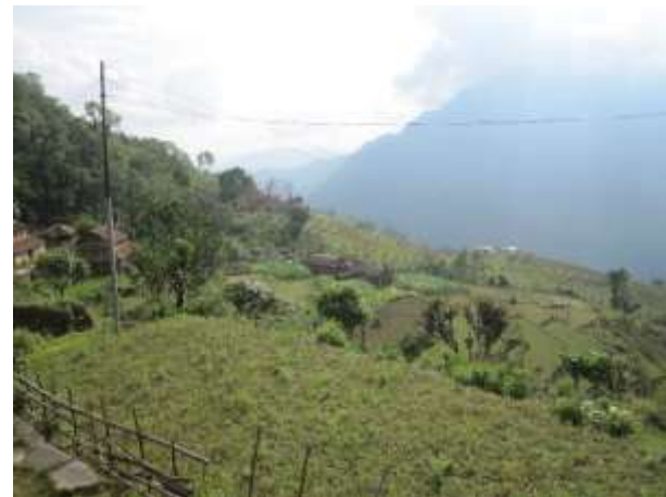
Figure 3 | Nayagaun, Lamjung, Nepal