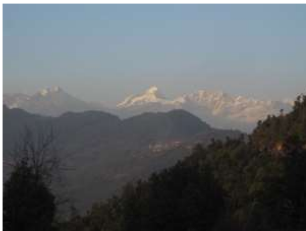
Figure 2 | Sermathang village with the Himalaya in the background

Hari produced a Yolmo-Nepali-English dictionary of the language with Chhegu Lama , [6] and a sketch grammar. [3] Hari also translated the New Testament of the Bible into Yolmo. [20] Original cassette recordings of her work have been digitised and archived with PARADISEC . [21] Unless otherwise stated, all discussion of the grammar of Yolmo on this page is drawn from the work on Melamchi Valley Yolmo.