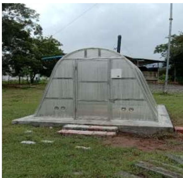
Fig. 2: Solar Dryer

The thermal behavior of the samples has been studied by TGA. The loss in weight of the material was analyzed. Normally the shape of the TG curve depends upon the nature of the situation of degradation reaction of the sample. The analysis of these data is often carried out with a view to estimate kinetic parameters like energy of activation of the degradation reaction. Figure 4 shows that there is a gradual decrease in sample weight with increase in temperature.