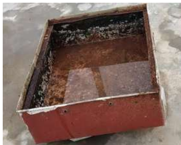
Fig. 3: Waste water inside the solar dryer