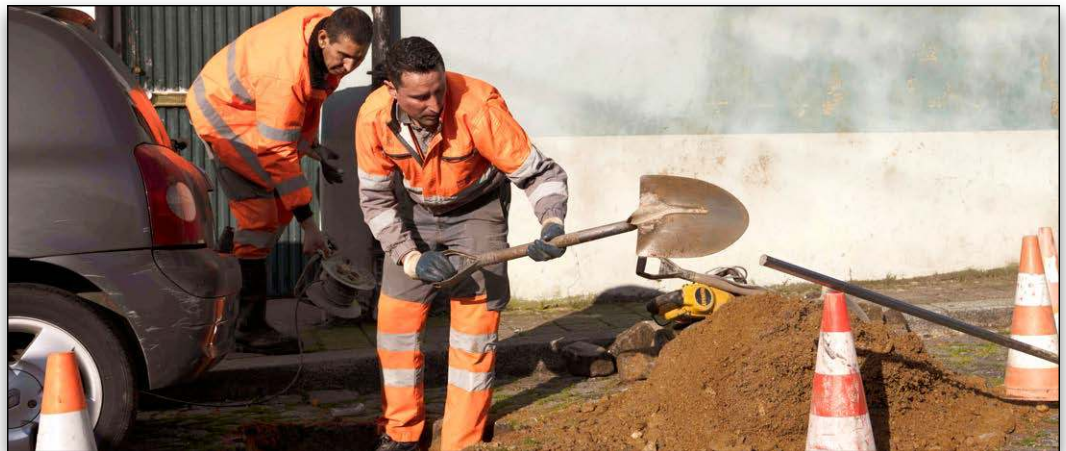
Maintenance quickly respond to issues and update system information while in the field.