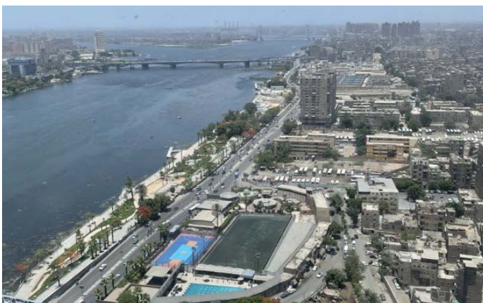
A birds eye view of Cairo City, Egypt.

Using OpenPaths, CitiME developed a proportionate and strategic transport model by incorporating and balancing a range of datasets, including data for mobility assessment and census data, as well as non-traditional data, such as road network vehicular traffic volume from GPS sources. The MTM includes a number of sub-models or applications with inputs, outputs, and loops. The flexibility and robust modeling capabilities of OpenPaths enabled CitiME to create traditional transportation models along with sophisticated and bespoke applications. The software used a macroscopic approach for strategic and multimodal modeling that accurately demonstrated in a visual platform the interaction between demand and offer to identify GCR mobility trends and principles to consider when making investments in transport initiatives.