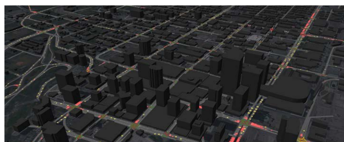
OpenPaths DYNAMIQ supports key decision support for operational traffic planning in lock-step with the city's capital planning project requirements.

Today, the citywide OpenPaths DYNAMIQ traffic simulation and dynamic traffic assignment model is trusted for operational traffic planning projects across the city, enabling longer-term planning studies and integration with the regional travel model.