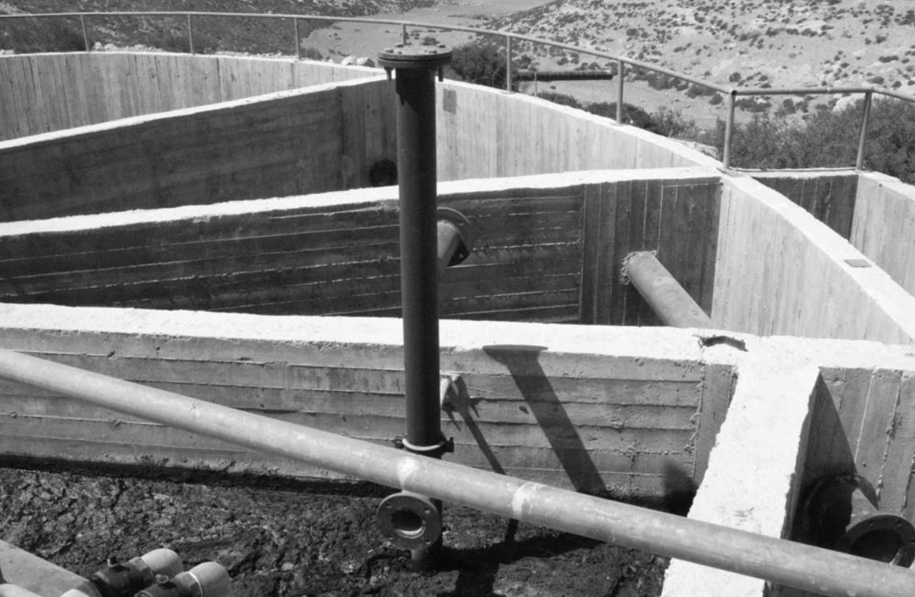
Wastewater flowing from Jerusalem into the Kidron Basin (Eyal Hareuveni, July 2008)

comprising 10 percent of the wastewater flowing into it. From the open duct, the wastewater is channeled along more than thirty kilometers towards the Dead Sea, where it flows over the cliffs into the Dead Sea itself.