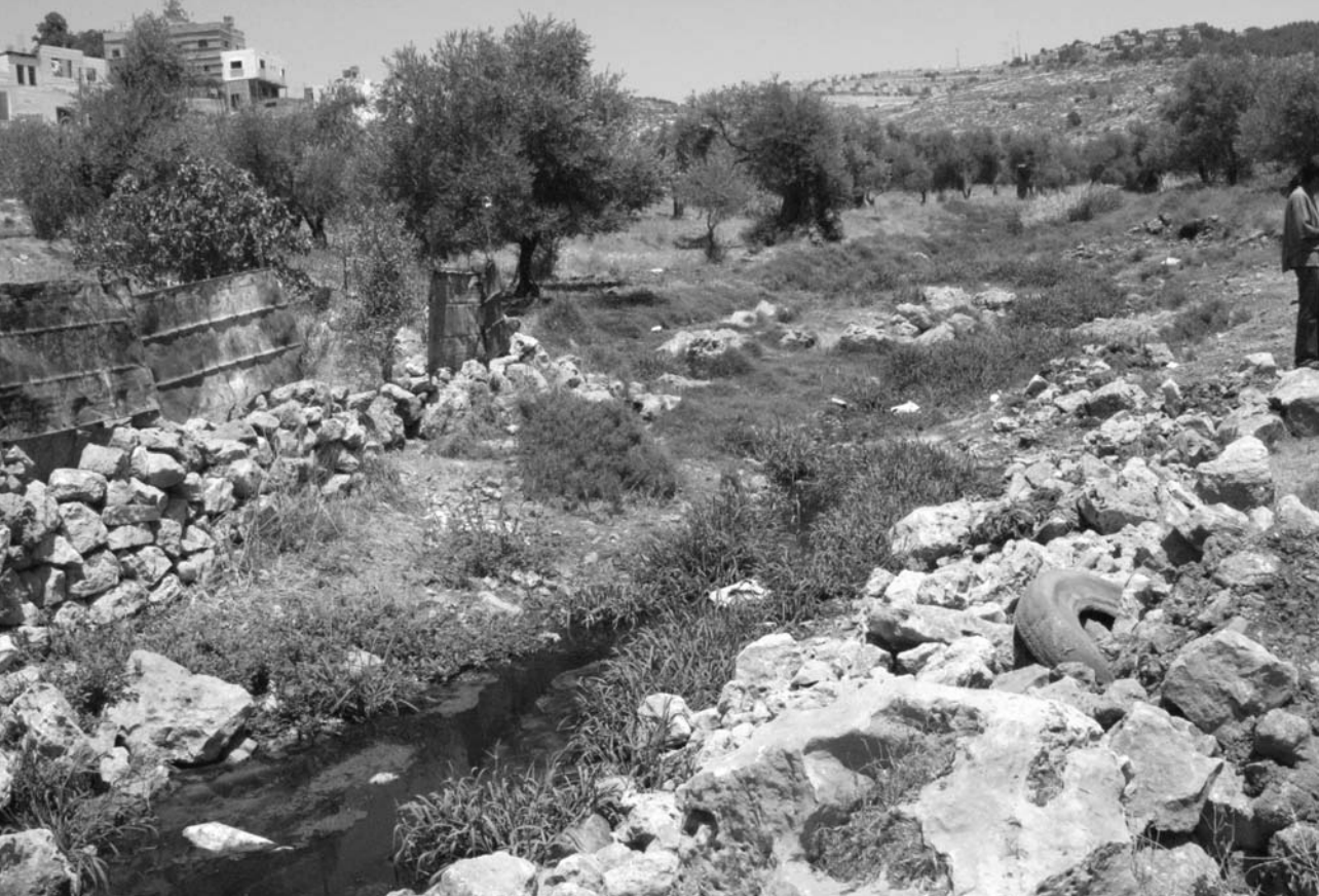
Wastewater of Ariel and Salfit flowing within the village of Brukin

that crops and water sources of 70 Palestinian villages near settlements had been contaminated. 98 An investigation by the State Comptroller in 1991 found that wastewater from six settlements endangered the quality of nearby water drillings, and that the raw wastewater of five other settlements flowed onto cultivated Palestinian land, damaging crops. The names of the settlements were not given. 99