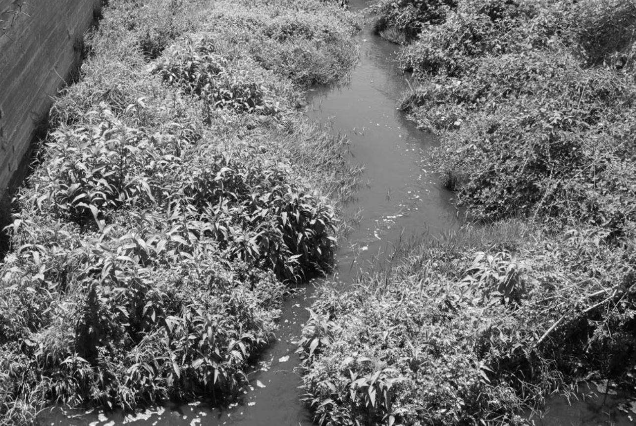
Wastewater from the Elon Moreh settlement, seen on the left, flows onto the lands of 'Azmut (Eyal Hareuveni, July 2008)

the extinction of the deer, rabbits, and foxes once common in the area and now, boars are the only animals found there. The natural vegetation, such as hyssop, has also disappeared. 114