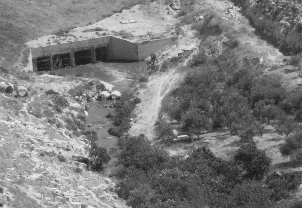
Wastewater flowing from Jerusalem into the Kidron Basin (Eyal Hareuveni, July 2008)

Two other alternatives, which do not require PA cooperation, are considered more complicated to implement. One is to build a treatment plant within the Jerusalem Municipality's borders, at the site allocated for this purpose in the 1970s. This possibility is deemed very complicated because of its proximity to houses in Jabel al-Mukabber and a-Sheikh Sa'ed, the danger of creating additional environmental nuisances, and the limited amount of land available at the site for building the facility. MAVTI estimates that it would take three years to build the facility. 49