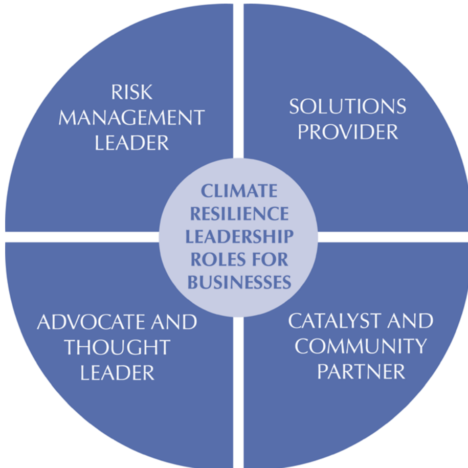
FIGURE 1: Climate Resilience Leadership Roles for Businesses

Below, we describe seven strategies ( Figure 2 ) that comprise an emerging blueprint for companies to assume these leadership roles. These strategies