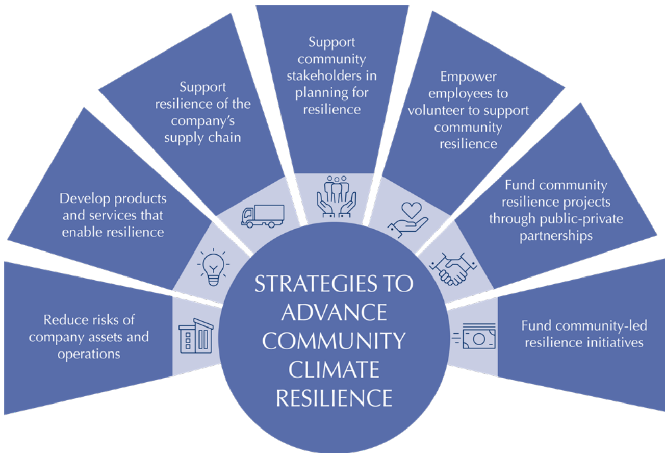
FIGURE 2: Corporate Strategies to Advance Community Climate Resilience