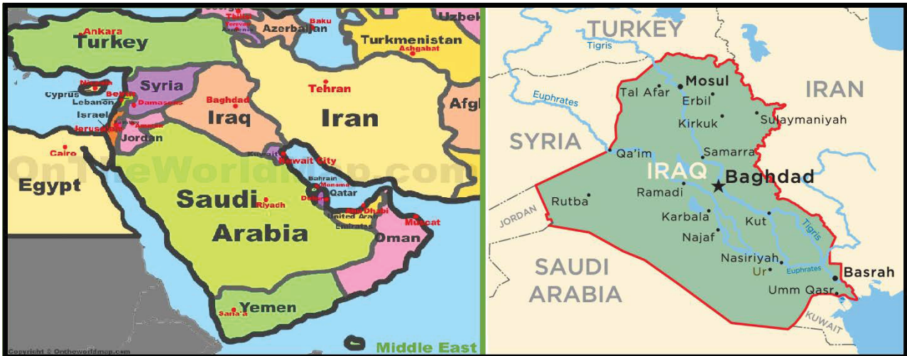
Figure 1. Location of Iraq within the Middle East.

Euphrates are the main two rivers of Iraq. The waters of these rivers come from Turkey (71%), Iran (6.9%) and Syria (4%) while the remainder is from Iraq. This implies that 100% of the Euphrates and 67% of the Tigris, waters come from outside Iraq respectively [9] [10]. Groundwater Resources reach 1.2 Billion cubic meters (BCM) and form only 2% of the consumed water. The flow of the rivers fluctuates from 10 to 40 BCM depending on the hydrological conditions with an average of 30 BCM [10].