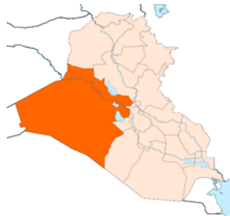
Figure2. WI (RNIC 2014)