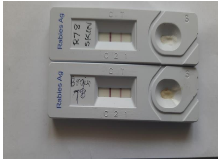
Fig 1: Brain and skin specimens on LFD

Figure 1 Brain and Skin specimens on DFAT as visualized under Olympus BX51 Fluorescent microscope.