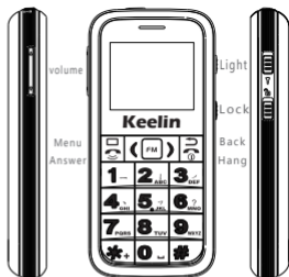
Left/Up OK Right/Down

Down to lock the keyboard UP to unlock the keyboard