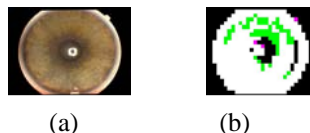
Figure 3: Example of (a) the image of an eye iris before pre-processing. (b) The pattern derived from (a) by pre-processing, which is used for learning (or subsequent recognition) of EPCN network.