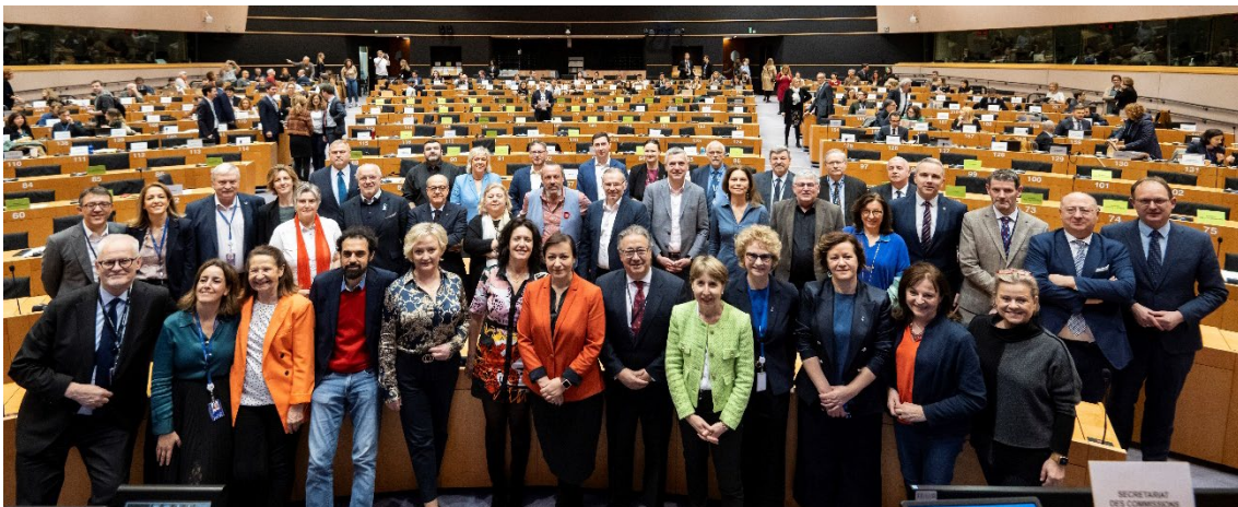
AGRI Committee meeting on 19 March 2024