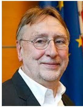
Chair: Bernd Lange (S&D) (2019–2022 & 2022–2024)