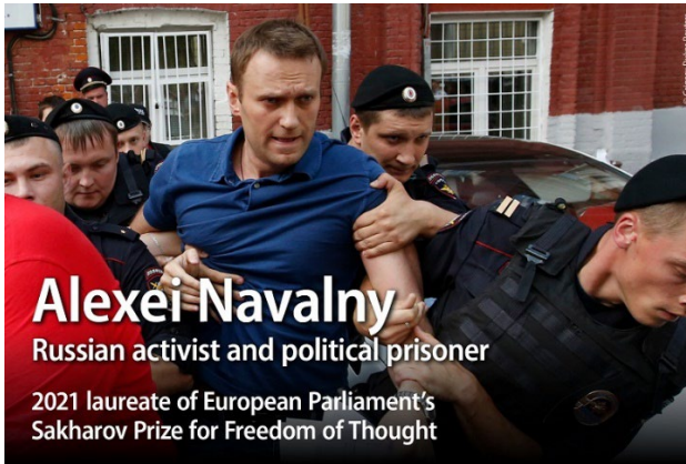
Alexei Navalny Russian activist and political prisoner 2021 laureate of European Parliament's Sakharov Prize for Freedom of Thought