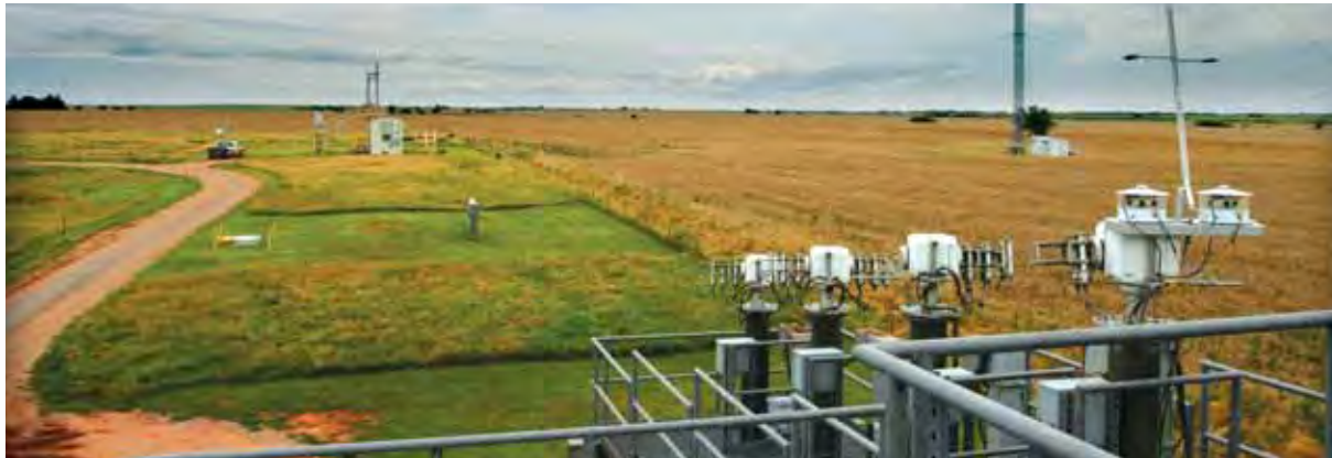
ARM/SGP Central Facility #C01