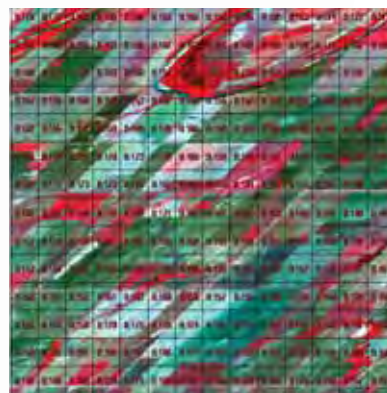
ASTER scene of the ARM/SGP Central Facility #C01 on 23 May 2006 superimposed with 500-m MODIS shortwave albedo values (bi-hemispherical reflectance)