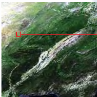
MODIS 500-m white-sky albedo (isotropic bi-hemispherical reflectance) of the Southern Great Plains, USA. Nominal date 23 May 2006, true-color image in sinusoidal projection

Official recognition is required of the need for long-term, high-quality field measurements of land surface albedo to monitor local climatic changes, model surface energy variations and validate regional and global albedo products. A modest increase in financial support for those field sites already equipped with sufficient personnel to maintain and monitor equipment to BSRN standards would enormously increase our ability to monitor surface albedo fluctuations worldwide.