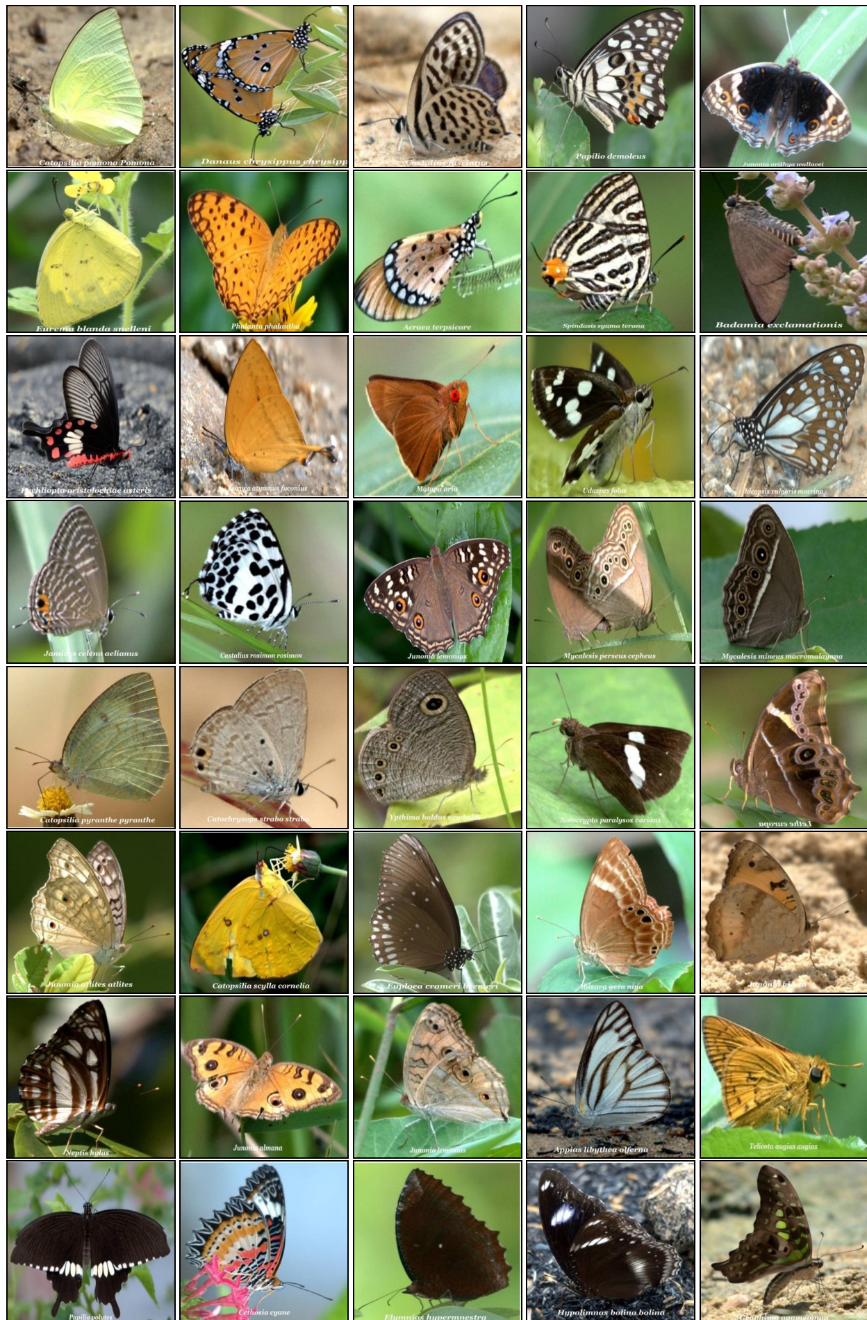
Fig 2. The original photographs of the butterfly (40 species) with the scientific name found at La Yang Taw, Nay Pyi Taw Union Territory in Myanmar from June-November, 2019.