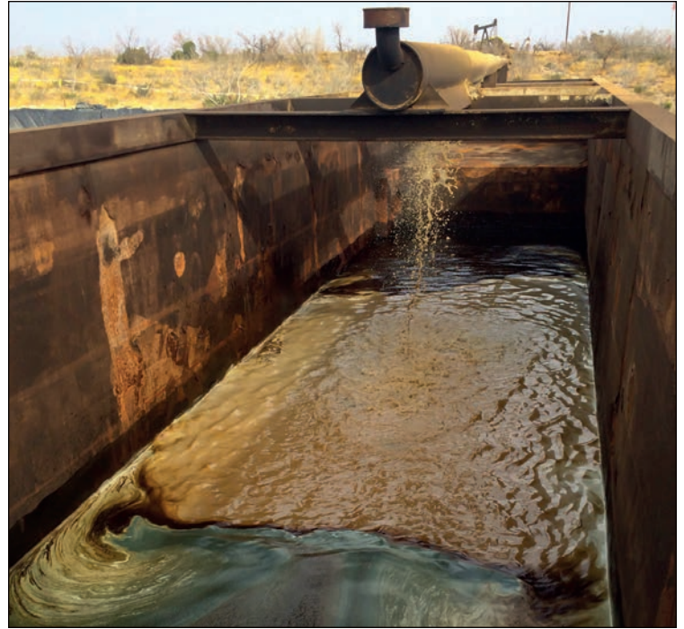
Oil and gas drilling operations use hundreds of millions of gallons of freshwater every year.

As California suffers climate change and endures longer, drier wildfire seasons, oil and gas operators use hundreds of millions of gallons of freshwater for drilling operations annually. 82 It is a vicious cycle: