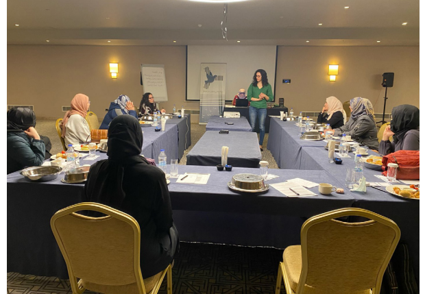
Women meet for a Focus Group Discussion in Gaziantep, Turkey, 2021

For instance, most survivors need medical care, in particular for genital trauma resulting from sexual torture, reproductive health complications, hormonal imbalances, and sexually transmitted diseases and infections. Most survivors also emphasise the importance of psychosocial support, to be provided as soon as possible following the CRSV incident(s) and for the long term. Also important to survivors are financial assistance and protection, particularly in the months following the violence. The physical and psychological impacts of sexual violence and other intersecting experiences such as being detained, abducted, forced into marriage or sexually enslaved, means that the life project of most survivors has been entirely shattered. For this reason, many survivors identify support to resume education, the identification of work opportunities or the provision of grants for 'small projects' as further essential needs. For survivors relocating, especially to a different country where language differs, assistance in housing, livelihood and legal support are also essential.