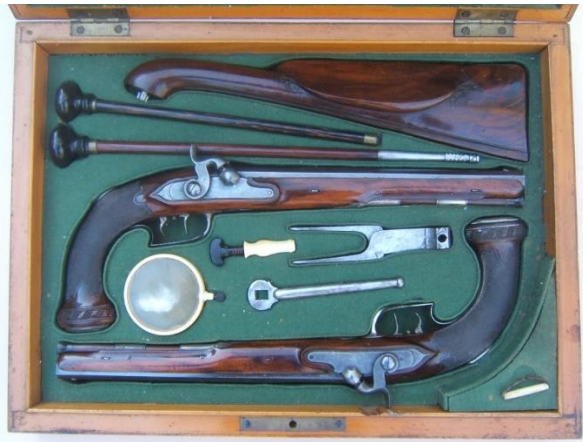
Ca. 1850s Howdah Pistol – with detachable stock

http://www.hallowellco.com/historical_gallery_antique%20guns.htm