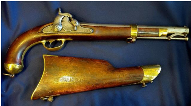
US 1855 Percussion Pistol-Carbine

https://www.liveauctioneers.com/item/71137886_1855-pistol-carbine-and-shoulder-stock