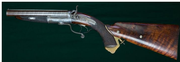
1852 Austrian Flintlock Cavalry Carbine – 13 ¼ inch barrel

http://www.hallowellco.com/historical_gallery_antique%20guns.htm