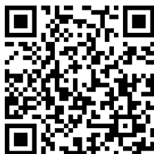
QR for iPhone