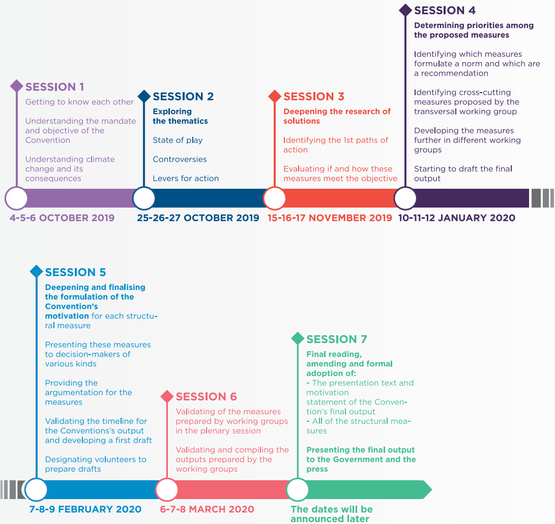
FIGURE 1. Schedule of working sessions for the Citizens' Climate Convention

by all of the citizens, and some were adjusted, before being translated legally with the support of the jurists committee and voted on during the final session.