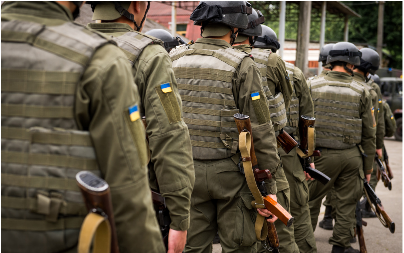
Kalashnikov rifle in the hands of the military in Ukraine

National Action Plan for the implementation of the Convention on the Rights of Persons with Disabilities 2012–2020.