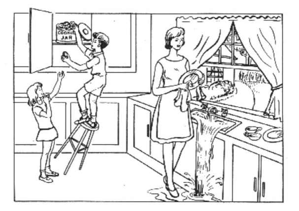
Figure 1: The Cookie Theft picture, from the Boston Diagnostic Aphasia Examination [21].

The topics used during discourse production may be subject to an internal, structural organization in order to achieve an information hierarchy. This organizational structure allows a gradual organization of information that is essential for an effec-