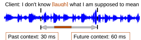
Figure 2: Example of extracting acoustic cues from speech. In this example, we trim the speech starting at 30 milliseconds before laughter begins and 60 milliseconds after laughter ends. This is followed by extraction of prosodic signals and computation statistical functionals on the speech segment.

Given that the models are trained on unbalanced data, we inversely scale the system probabilities/ fusion scores for each