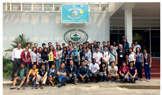
Figure 4. Group photo at the 2015 summer school in the Philippines.

Apart from the ACRS, two additional SS were organised. The first one occurred in Addis Ababa, Ethiopia in 2013 as a response of the SC to the growing need for further knowledge and education in remote sensing and other geospatial sciences in this country. This was an important SS for the SC since it signified the expanding reach of the organization. Through the assistance of local authorities in 2013 at the UN Economic Commission for Africa (UNECA) Headquarters in Addis Ababa, this SS was able to accommodate participants from six African countries (Rwanda, Uganda, Tanzania, Ethiopia, Nigeria, and Kenya).