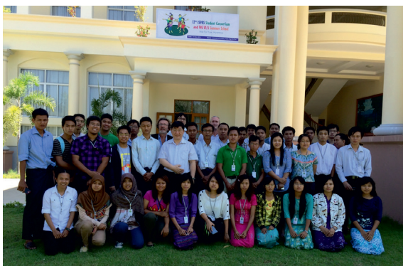
Figure 3. Group photo at the 2014 Myanmar summer school.