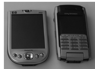
Figure 1. Mobile devices

cannot be expected that the general public will search specialist forums nor to go through any other complicated procedure to obtain the technology. The technology must also be provided in a form people understand and can use, otherwise it does not matter if it is readily available. Thus the technology needs to be self-explanatory and the interaction so natural that it can occur without instructions.