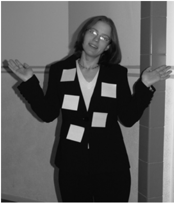
Figure 2. Post-it notes

at the right time. If we forget to look at our notes, which is bound to happen occasionally, then we may miss those times when we really need to get reminded.