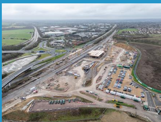
The view from above