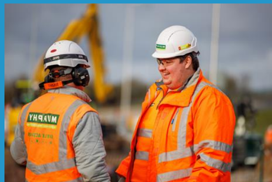
Construction team on site