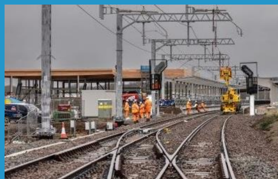
The view from the train cab