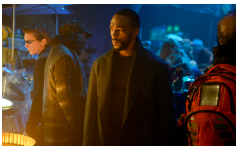
Altered Carbon: Season 2 - © 2020 Netflix