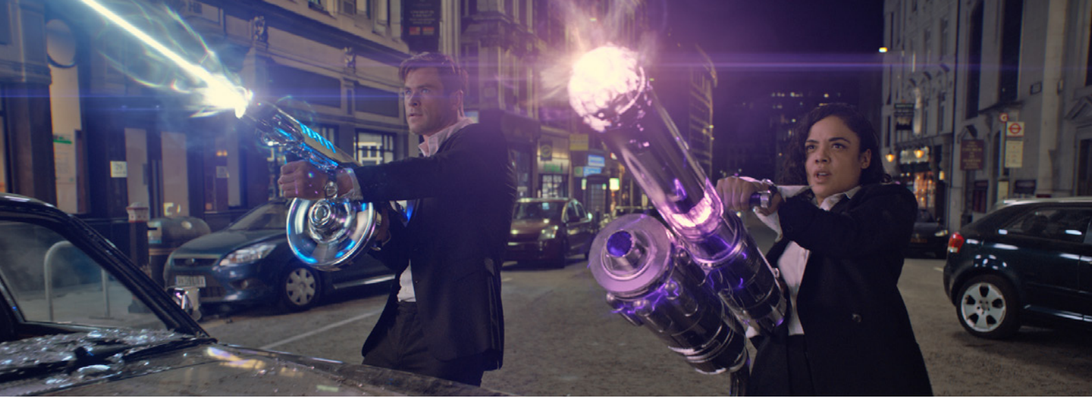
Men in Black: International

“Most artists don’t even notice a difference between NVIDIA vGPU-powered VMs and physical workstations.”