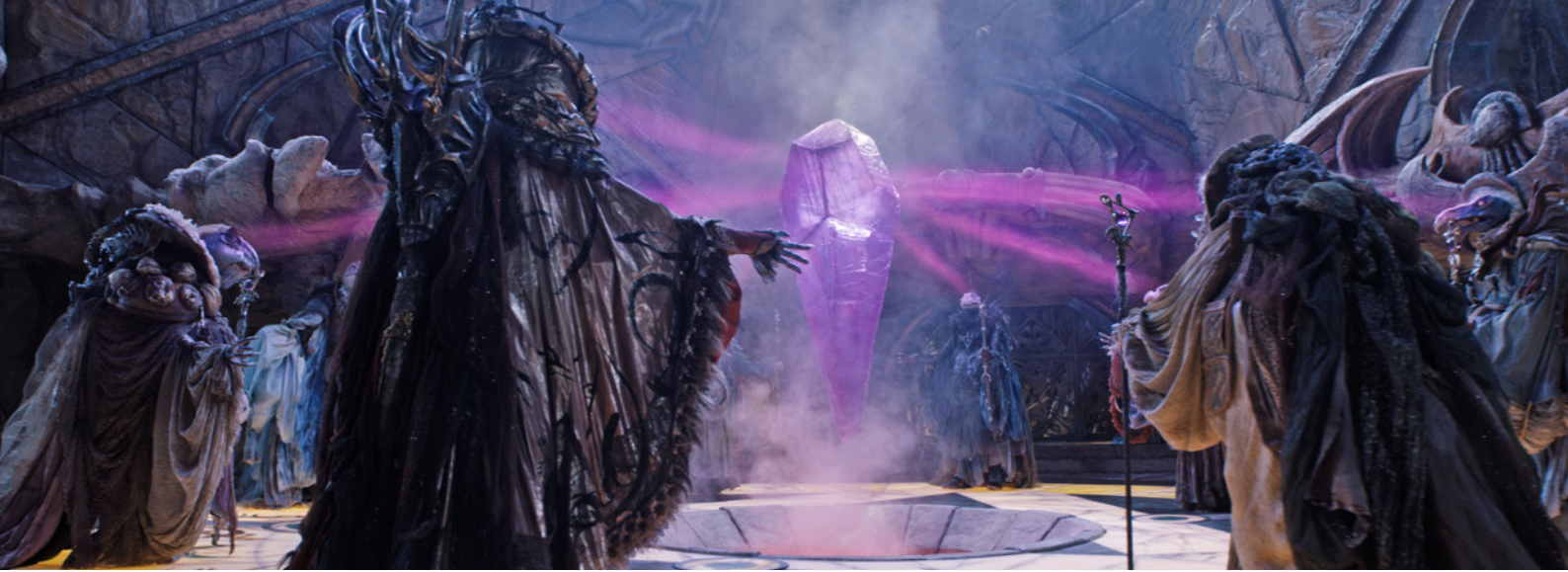
The Dark Crystal: Age of Resistance

access remote desktops. To ensure a good experience, each artist was assigned an 8 gigabyte (GB) frame buffer. On this setup, each P40 GPU could accommodate three artists (six artists per server).