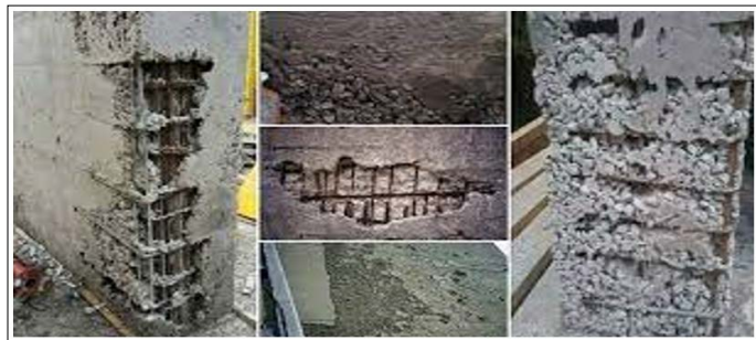
Figure 2.0: Disadvantages of Universal Concrete in Congested RC [1]

work [1] Recycling waste materials would be a perfect way of overcoming the escalating rate of environment pollutions as well as reducing the cost of producing SCC. Construction industry sustainability is a current trend that requires to be examined in Nigeria. The originality of this study will be to provide awareness on the incorporation of cementitious waste materials in design of SCC and its application in congested reinforced concrete structures that could be an added benefit to the building and civil engineering industry in Nigeria for a long period of time. These benefits can be classified as ecological, economic and environmental impact by reduction in energy required for cement production, mitigation of the emission of greenhouse gas, speed of construction work and reduction in the cost of quality building and Engineering facilities.