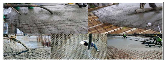
Figure 1.0: Various applications of SCC (Buari [1])

of organic and non-organic materials. The essence of additional materials in SCC design is to reduce waste and increasing strength and durability characteristics of the concrete. Globally, various researchers have designed SCC by partial replacements of aggregates using recycled concrete aggregates, iron slag, coal fly ash and agricultural wastes. However, in Nigeria, utilizations of SSC potentials through design and application are limited. Hence, this paper reviews.