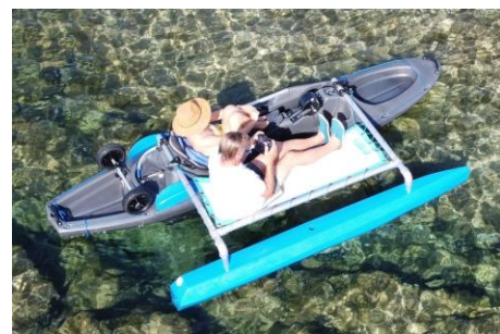
Keels, propeller and rudder