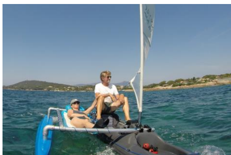
Swimming and sunbathing

A stable sailboat allowing its pilot to relax!