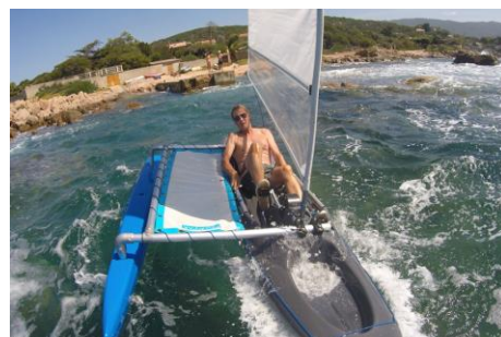
Electric drive version