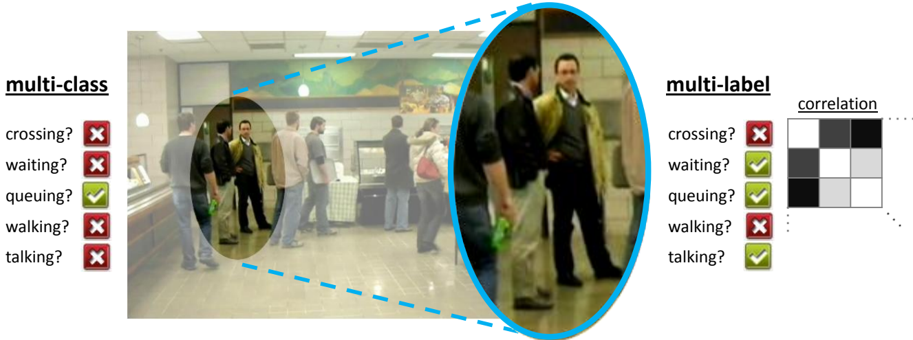
Figure 1. The case for multi-label action recognition. People in natural settings perform more than one action at the same time. Our approach takes into account pairwise correlations to ensure assigned action combinations are meaningful.

label correlations is empirically shown to yield classifiers with better performance accuracy. Finally, given the lack of datasets for our task, we relabeled the UCLA Courtyard dataset [1] using the same set of labels, but instead each actor is assigned a subset of labels instead of a single label.