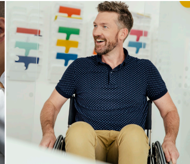
Disabled-Owned Business Enterprises

We encourage diverse suppliers interested in more information about potential working opportunities with SAS to email supplierdiversity@sas.com .