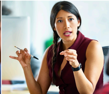
Women Business Enterprises