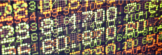
Software, Hardware and Telecom