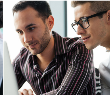
LGBTQ+ Business Enterprises