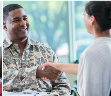
Veteran and Service-Disabled Veteran Business Enterprises