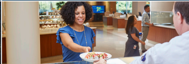
Facility, Food and Fulfillment Services