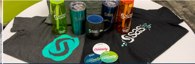
FF&E , Office and Promotional Supplies