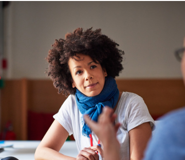
Minority Business Enterprises

We know every person and business has the potential for unique contributions. Our customers represent a wide range of industries, people and locations – and we want this same diversity reflected in our supplier community.