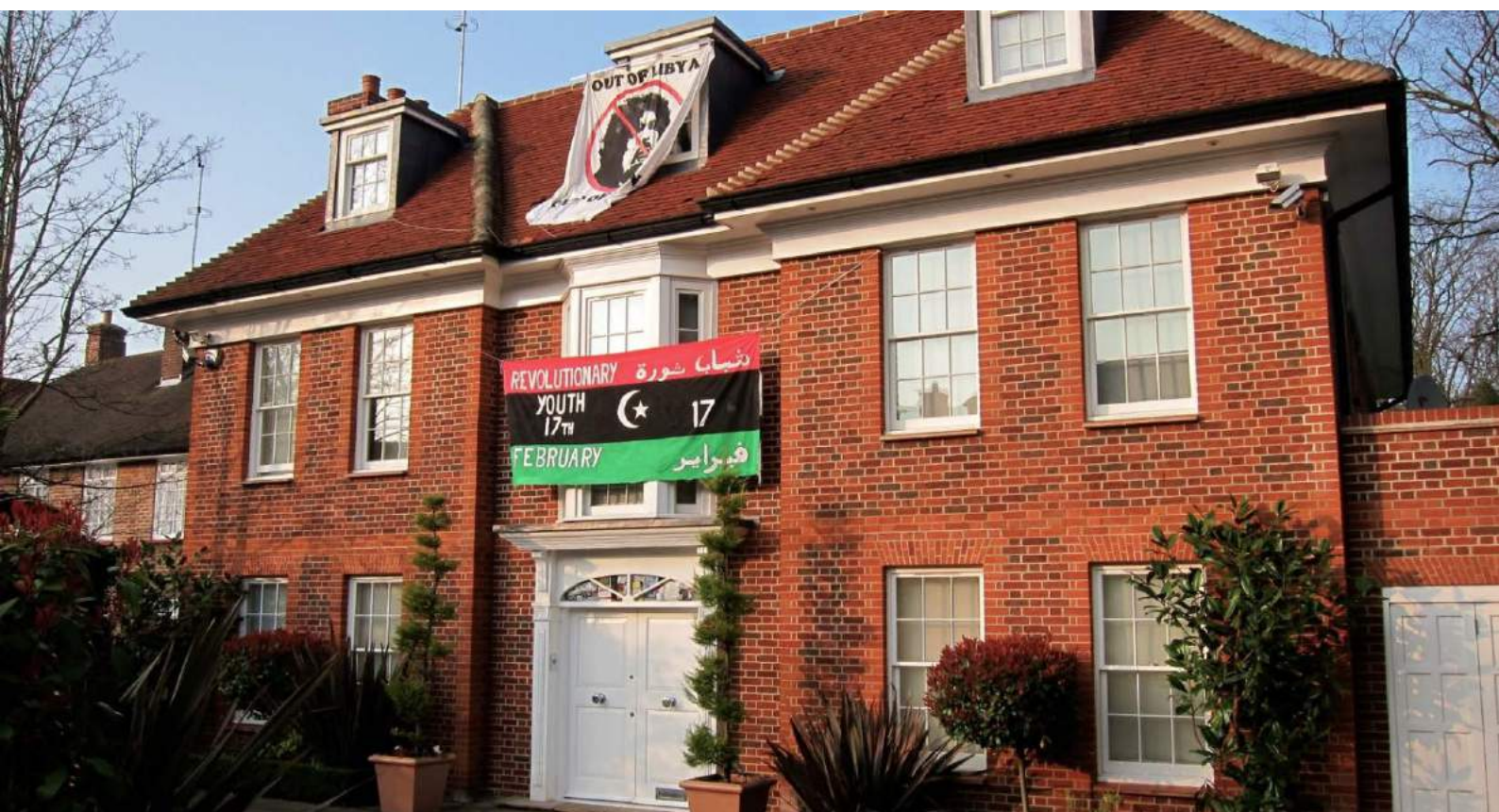
Figure 3: Saadi Gaddafi's former London house

Despite the Arab Spring occurring five years ago the vast majority of Libyan assets here remain frozen by the UK Government, and not fully confiscated. 68 A small but notable exception is the recovery of £10 million from a North London mansion owned by Colonel Gaddafi's son Saadi. 69