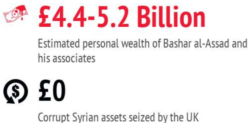
Figure 1: UK-Syria asset recovery record

The asset recovery process is long and has many stages. Assets are at first frozen by authorities; however this is only the initial stage and doesn't constitute full asset recovery. For assets to be fully recovered, they must be seized in criminal or civil proceedings and eventually, as stated in article 51 in the United Nations Convention against Corruption (UNCAC), returned to the country of origin. 41 Based on the available information, the £100 million in frozen Syrian assets has not yet been seized.