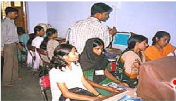
Fig. 1. Rural computer lab

department, rural schools have improving its infrastructure facilities. But the development is not uniformly in all rural areas; still many areas are neglected from even basic infrastructure facilities. Though, governments are providing ICT facilities to rural schools. Many of them are not working properly. The reasons such as, lack of accessibilities of the facilities by the beneficiaries, beyond the level knowledge of users and not full fill their needs or beyond their level of needs. Thus, whenever implement the ICTs related programmes in the rural areas, should be assess local conditions and priorities needs of rural students. The assessment of needs should be following the methods of dialogue, survey and discussion with beneficiaries in rural areas. First they have to understand the real benefits of the programme then only it will sustain in long term and perform effectively in rural areas.