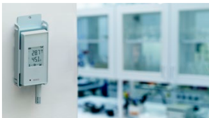
VaiNet RFL100 Radio Frequency Data Loggers

The Vaisala VaiNet Wireless technology uses sub-GHz frequencies to provide better signal propagation in environmental monitoring applications. Most industrial monitoring systems equipped with wireless devices use some sort of redundancy to protect against any single point of failure in a network of data loggers. VaiNet creates redundancy by distributing the signal load across several network access points. The wireless signal strength between access points and data loggers determines the optimum data path. Access points use Power over Ethernet (PoE) to reduce cabling and allow easy connection to a UPS*. A separate power supply is provided for installations where PoE is not available. Additionally, most RFL100 models are fully wireless, powered by batteries to ensure that the system continues monitoring during power outages. Each logger can maintain up to thirty days of data if the wireless network loses connectivity, and the access points provide additional data storage should the Ethernet LAN fail. As soon as the network is restored, data loggers and access points automatically backfill all historical data to the monitoring system software to ensure gap-free historical records.