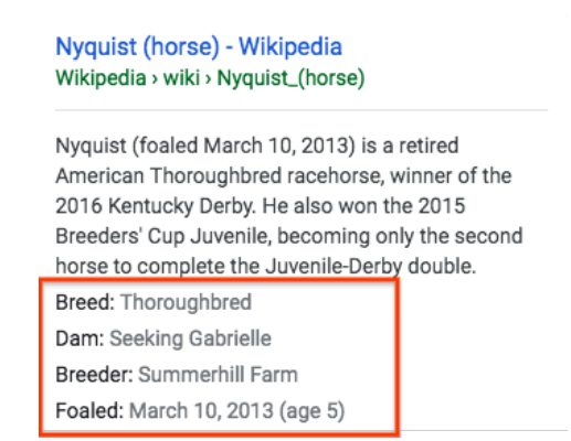
Figure 5: Structured Snippets providing long tail structured data as part of Google search result's snippet

Richer snippet presentation using "knowledge carousels" constructed from horizontal tables was explored in [12]. Knowledge carousels found a surprisingly powerful application in