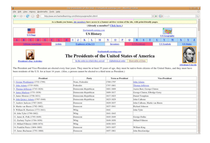
Figure 1: A typical use of the table tag to describe relational data. From the original WebTables paper.

Proceedings of the VLDB Endowment, Vol. 11, No. 12 Copyright 2018 VLDB Endowment 2150-8097/18/8. DOI: https://doi.org/10.14778/3229863.3240492