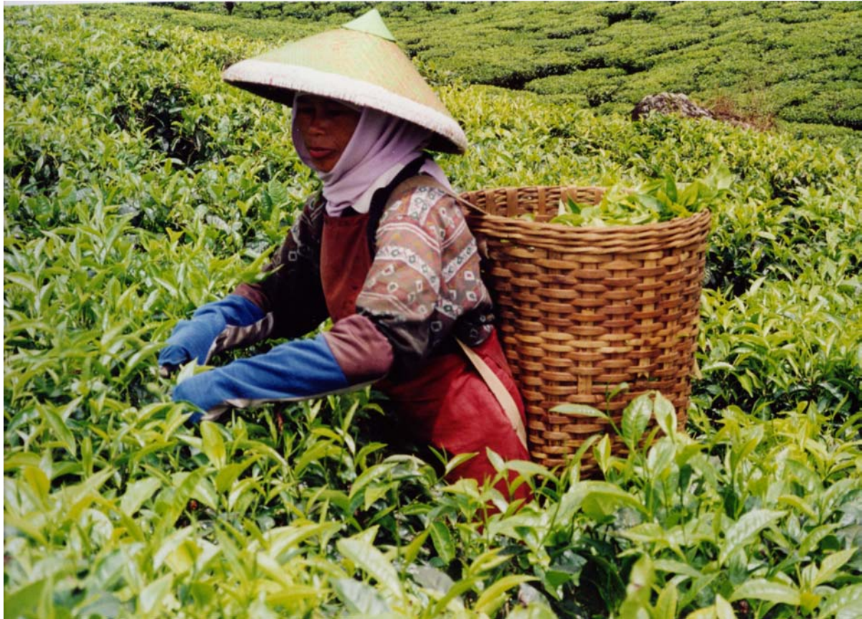
Figure 2.1. Tea harvesting in Indonesia.